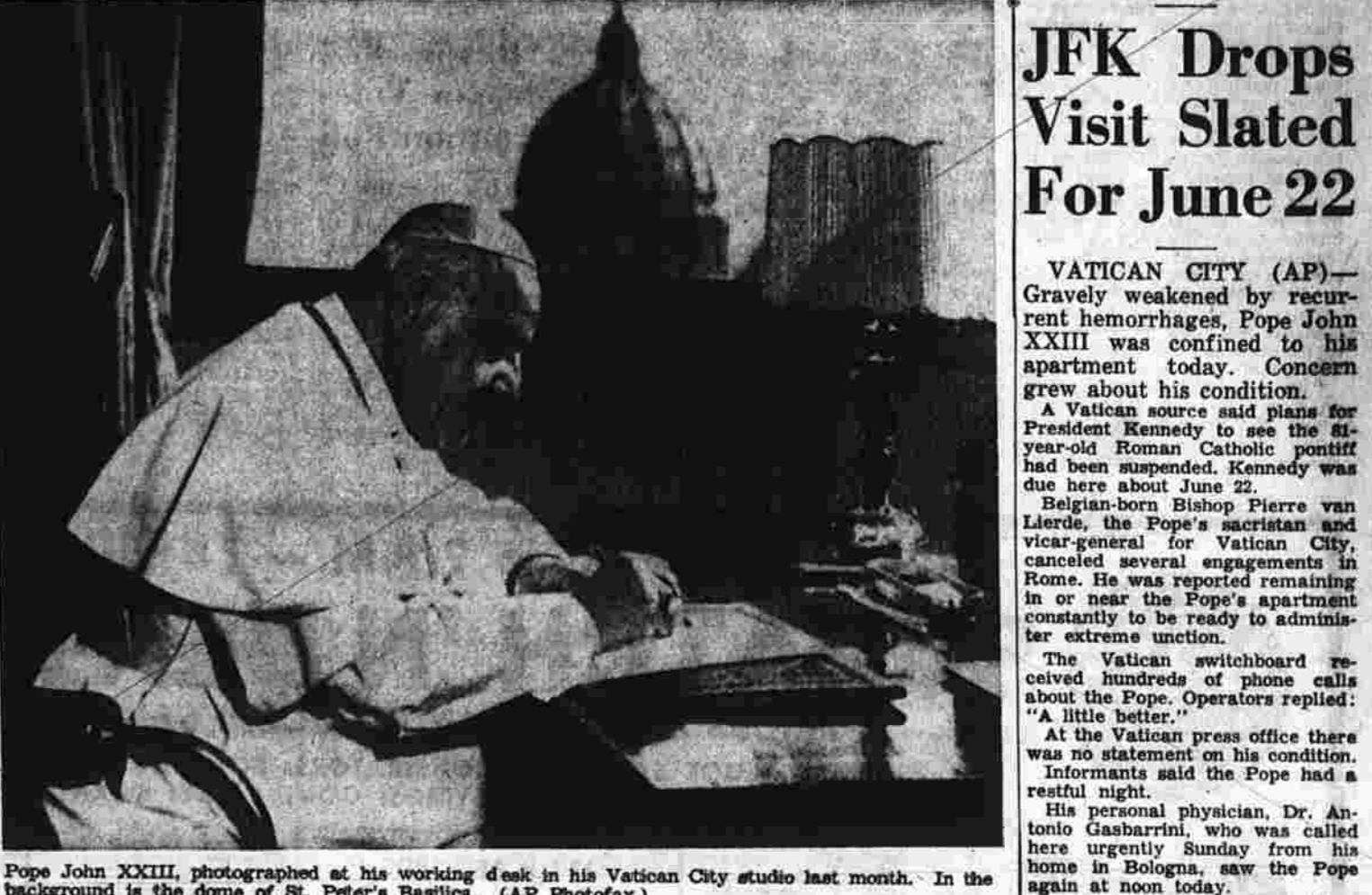
Pope John XXIII, photographed at his working desk in his Vatican City studio last month. In the background is the dome of St. Peter's Basilica.